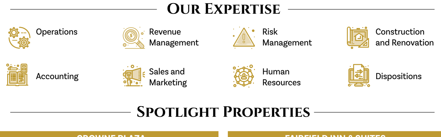
CROWNE PLAZA Dulles International Airport

Our team of seasoned professionals possesses a deep understanding of the hospitality industry's complexities. Whether managing full-service, select, branded, boutique hotels, or resorts, SharCon Management delivers tailored solutions that enhance guest satisfaction, optimize operational efficiency, and maximize revenue.